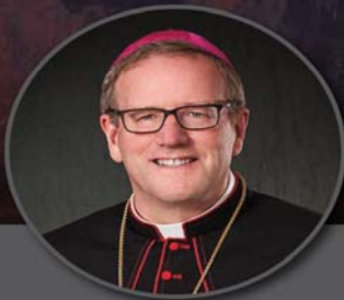
Bishop Robert Barron